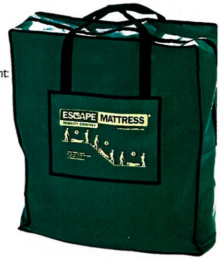
Article Number: 11000