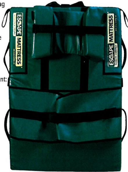
Article Number: 1100010

The Escape-Mattress® Compact is a complete Escape-Mattress® but its smaller dimensions allow it to be used flexibly. The Escape-Mattress® Compact is rolled up and stored in the storage bag included. This Escape-Mattress® Compact is more suitable, so that it can be taken to different situations where an evacuation aid is required.