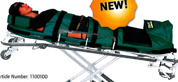
Article Number: 1100100